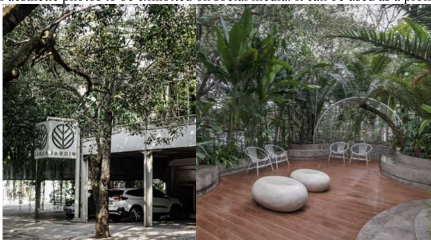
Figure 1. Exterior Café Jardin

Jardin cafe is one of the most famous cafes in Bandung and is one of the cafe restaurants in Bandung that many young people visit. This cafe carries plants and greenery as a general exterior and interior concept. Plants and greenery can be seen outside this cafe, as shown in picture 1. The name Jardin in French means garden or garden, so according to the meaning, the interior style carried by this cafe is natural tropical. The hallmark of the tropical style is an expansive terrace, which has lots of air ventilation, ample roof space, an open space arrangement and plants. With the use of this natural tropical interior styling, the interior atmosphere of this cafe seems like being in the middle of a park or garden (Figure 1). Jardin cafe has an attractive interior concept, so it is suitable as a gathering place or adding to a collection of aesthetic photos to be exhibited on social media. It can be used as a promotional event.