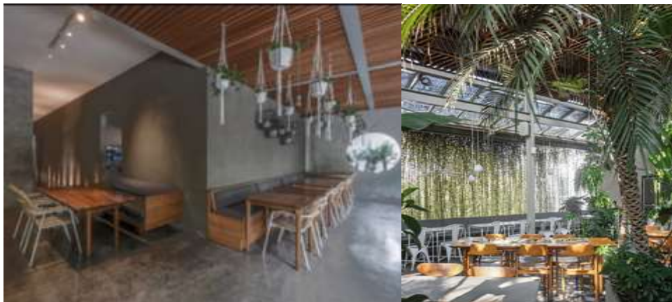
Figure 3. Area Makan Semi Indoor Café Jardin

Natural lighting is an essential component of any interior design that incorporates a greenery and plant system. Plants can grow faster and be more prolific when exposed to natural light. It is a difficult task to create a room that maximizes the amount of light that comes in a while simultaneously maintaining the comfort of the visitors.