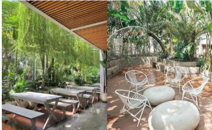
Figure 2. Area Makan Outdoor Café Jardin

Natural lighting is an essential component of any interior design that incorporates a greenery and plant system. Plants can grow faster and be more prolific when exposed to natural light. It is a difficult task to create a room that maximizes the amount of light that comes in a while simultaneously maintaining the comfort of the visitors.