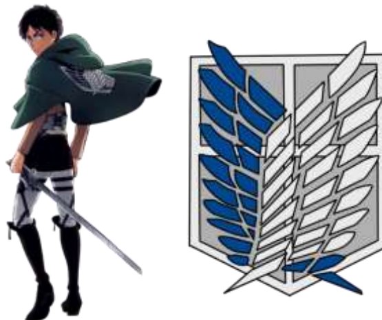
Figure 1. Eren Yeager (season two) with the Survey Corps symbol

In season Two, Eren debuted as a member of the Survey Corps, a branch of the core military tasked with overseeing the outer walls. In this season Eren learns that he can transform into a titan creature inherited by his father. Eren began to recognize that the outside world is a harsh world, at that moment he had to accept the fact that many victims had fallen during his duty in the Survey Corps [6].