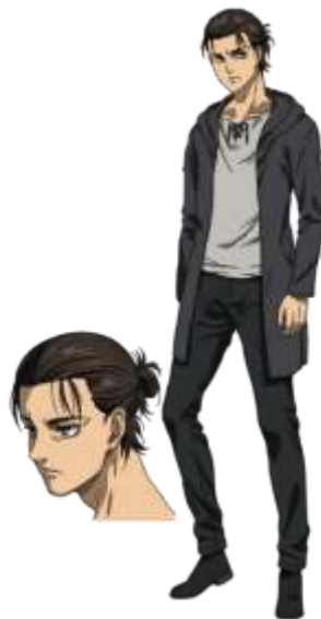
Figure 4. Eren Yeager (third season)

In the Fourth season, Eren managed to infiltrate a country called Marley, there he learned the truth that the Marley people have a personal grudge against the walled nation formerly called the Eldia. The Eldia themselves are a nation that has special blood that can turn themselves into titans in a certain way. Eren's determination to destroy the Marleys is getting worse. There he was also determined to kill all those who had brought down the Marley people utilizing genocide. His friends disagree with his goal and try to stop Eren.