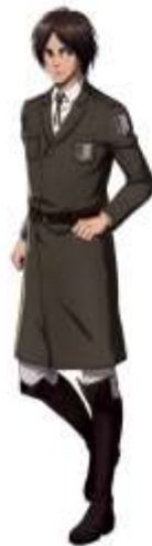
Figure 3. Eren Yeager (season three)

In the third season, Eren begins to learn the truth of his father's legacy that the titan was once a human as usual, and is controlled by one of the government countries out there called Marley. After knowing this, Eren's ambition is to destroy the people involved with the government [6].