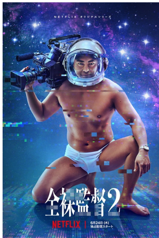
Figure 1. Poster of Naked Director 2 Movie

In this study, the method used is the descriptive analysis method with an approach using semiotics because it fits the research object. The descriptive analysis method itself is an analytical method where the research object will be described carefully according to the existing visuals, where the research object in this case is the poster. will be divided into several Visual sections and then the meaning will be examined one by one [7]