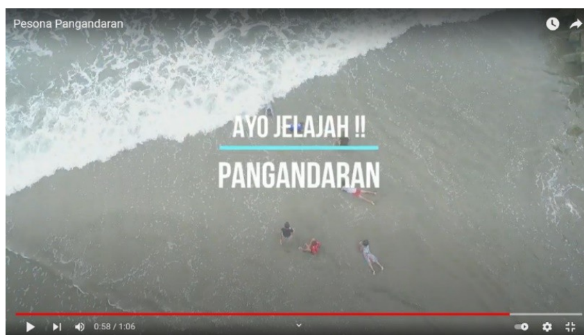
Figure 5. Screen Capture of Invitation Text

In delivering its message, the tourism analysis and marketing division uses text and audio in the video advertisement as an effort to convey a message of invitation. In image 2. which shows the text that appears on the video ad to shows the invitation. Even though the video does not use the direct word for invitation such as 'visit' and only uses the phrase 'ayo jelajah' it still has the same meaning which to deliver the invitation to visit but implicitly.