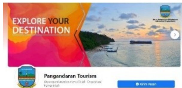
Figure 4. DISPARBUD Facebook of Pangandaran Regency