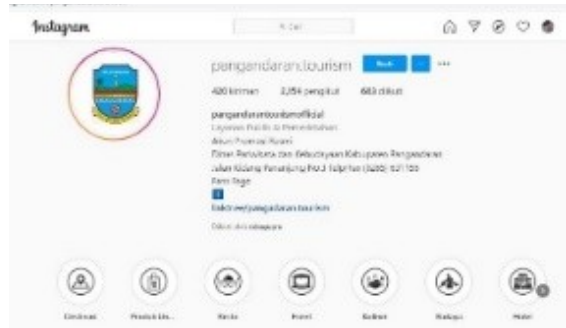
Figure 2. DISPARBUD Instagram of Pangandaran Regency