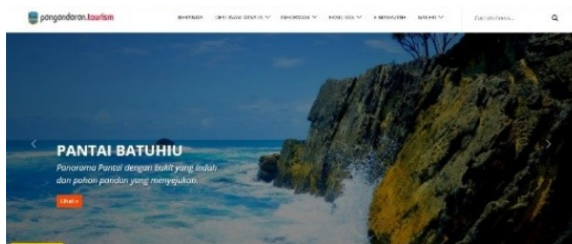
(e) DISPARBUD Website of Pangandaran Regency (tourism.pangandaran.kab.go.id)