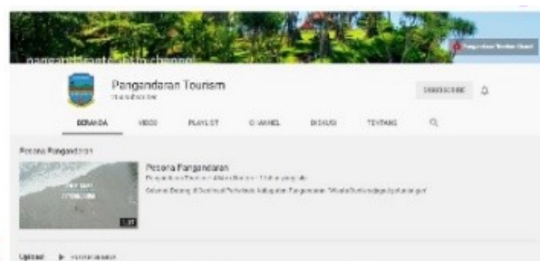
Figure 3. DISPARBUD YouTube of Kabupaten Pangandaran